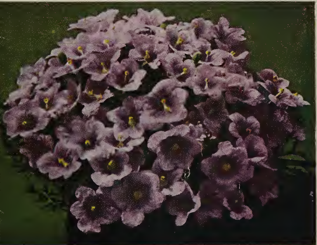
NIEREMBERGIA HIPPOMANICA Seed, pkt. 25c. Plants, 5c each, 50c doz.